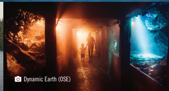
📷 Dynamic Earth (OSE)