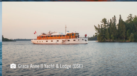
📷 Grace Anne II Yacht & Lodge