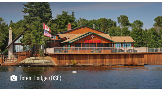
📷 Totem Lodge (OSE)

The OSE is linked with the Canadian Signature Experiences Collection (CSE), managed by Destination Canada, in order to both act as a stepping stone for Ontario tourism operators who aspire to be included in Canada's international marketing and to highlight the diversity of Ontario experiences.