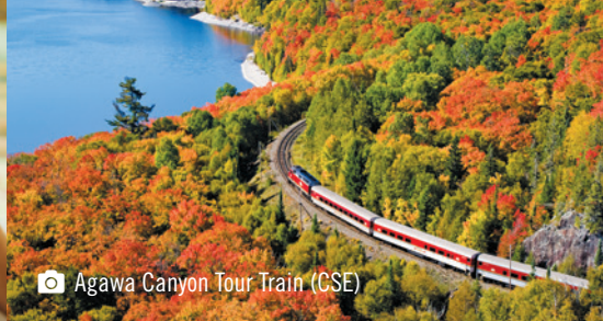
📷 Agawa Canyon Tour Train (CSE)